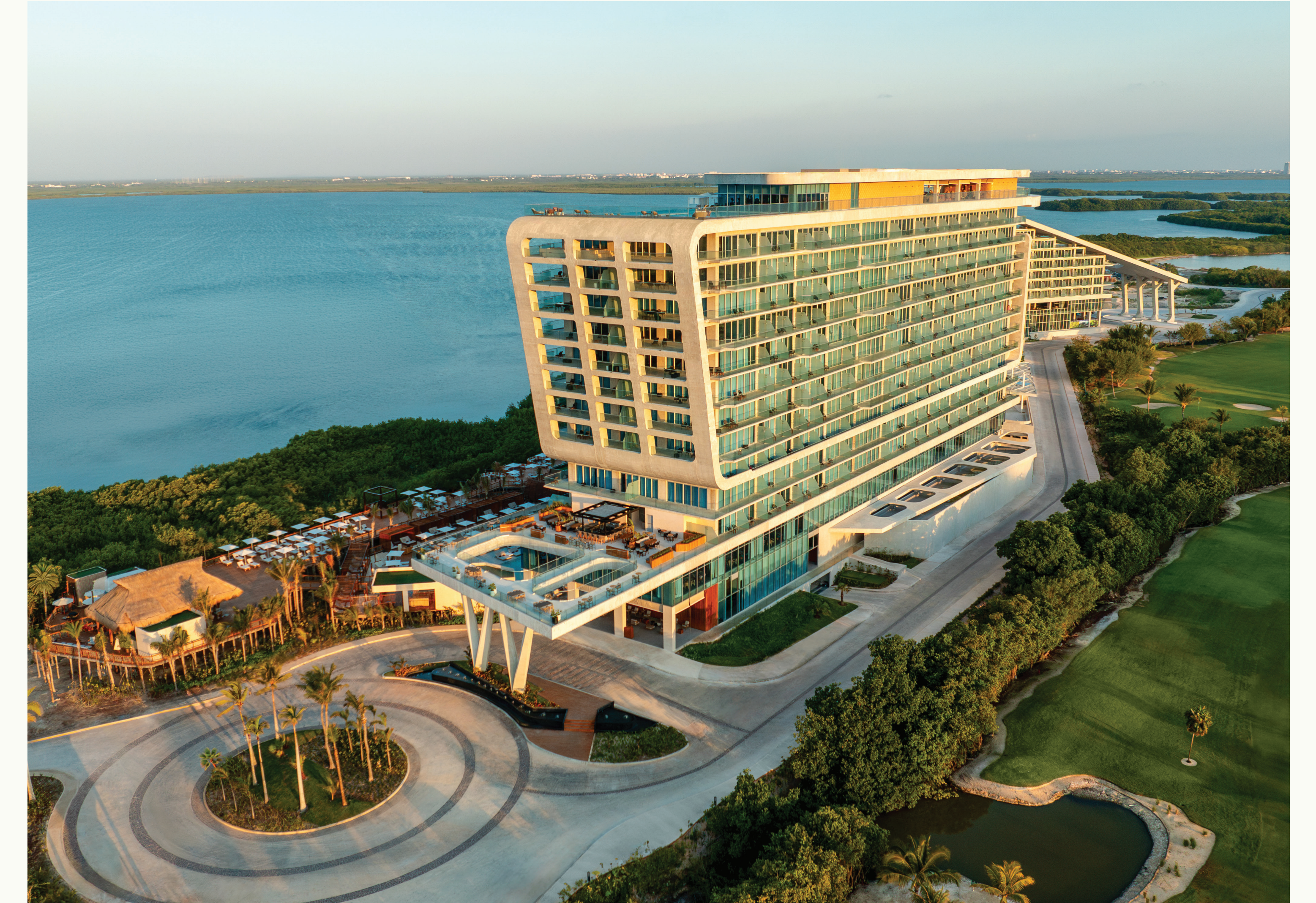
Hyatt Vivid Grand Island