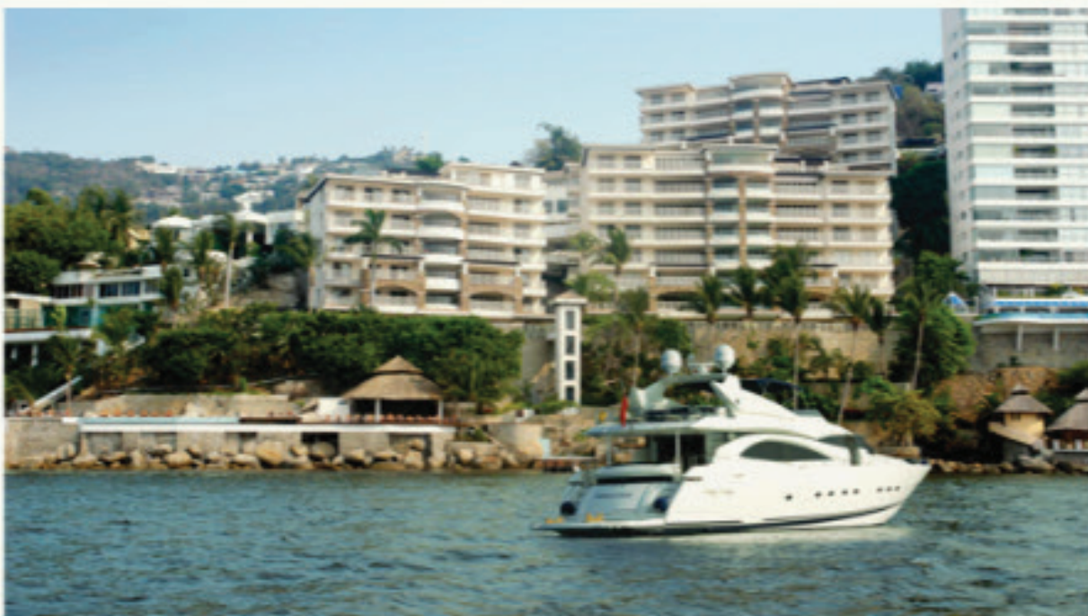
The only boutique development in Acapulco featuring classic Mediterranean architecture, with 32 exclusive condominiums and a private dock.