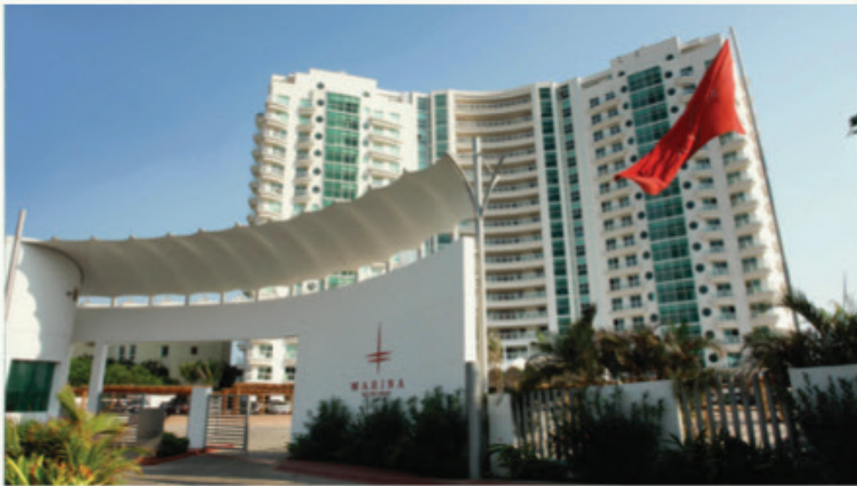
Located in the exclusive area near the Yacht Club, it features three modern 16-story towers and 255 luxury condominiums with extraordinary oceanfront amenities.