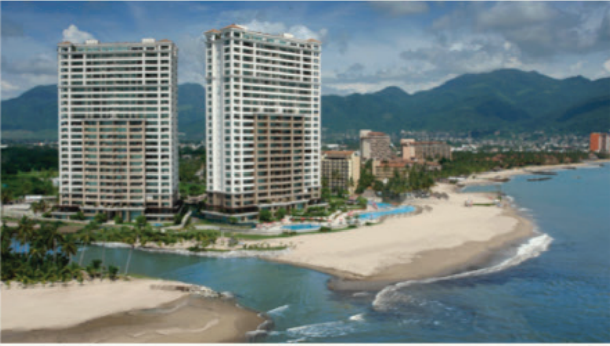
Luxury residential development located across from Banderas Bay in Puerto Vallarta with 594 apartments sold.