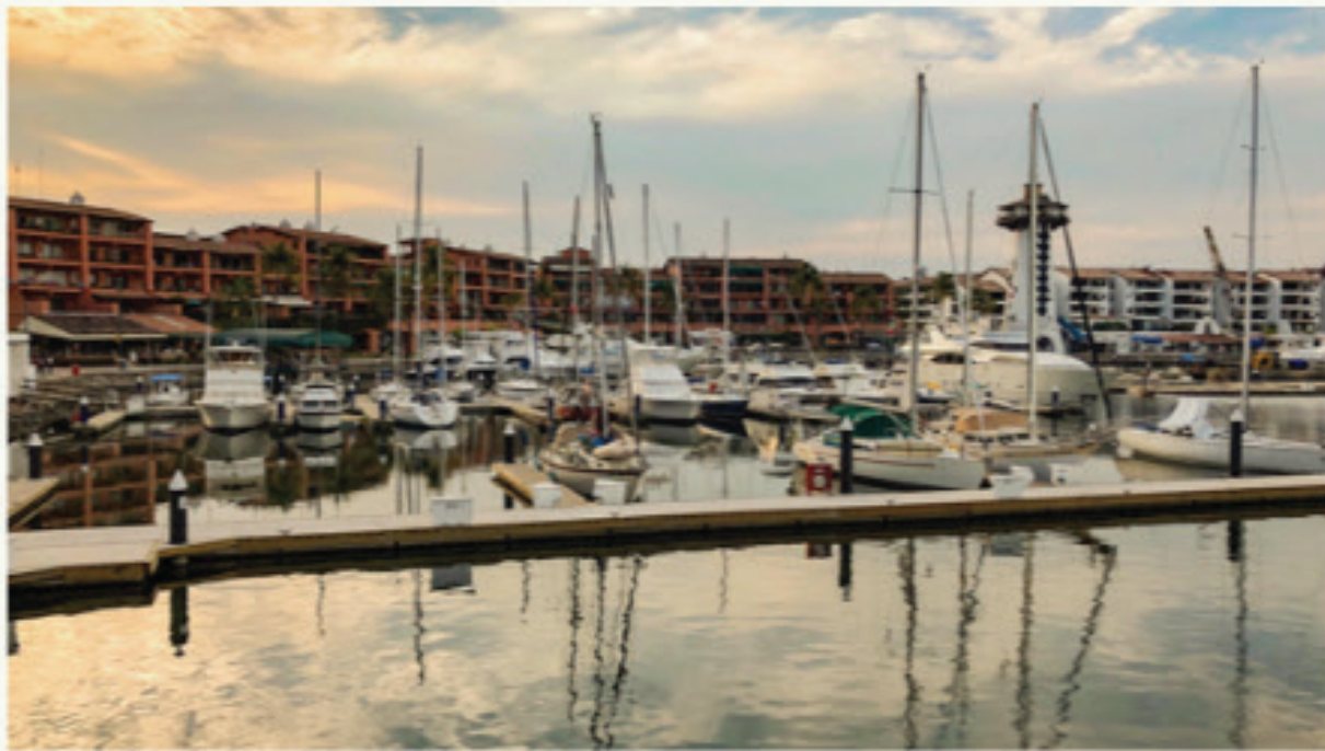
With a renewed operating concept, the Marina Vallarta, with 354 slips of up to 200 feet, is efficiently managed by Murano.