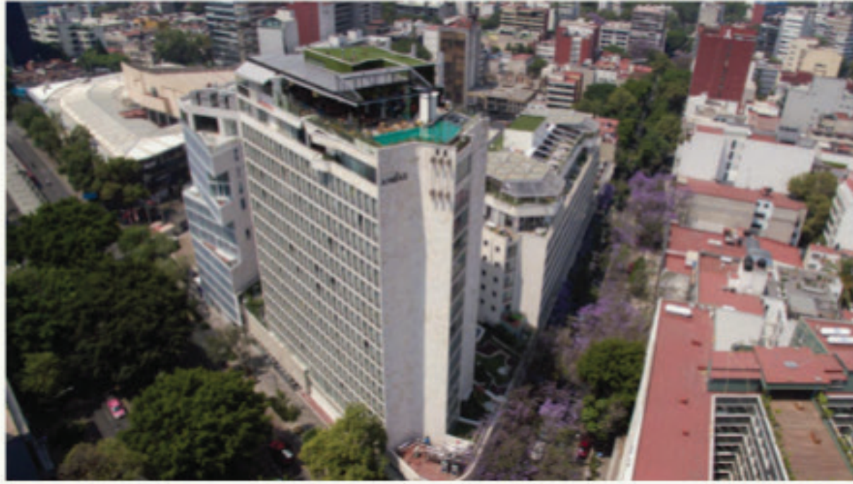
On October 26, 2022, the i421 Live District complex, featuring the Andaz and Mondrian brands, opened in the Condesa neighborhood.

i | 4 | 2 | 1 LIVE DISTRICT ROMA-CONDESA | MEXICO CITY