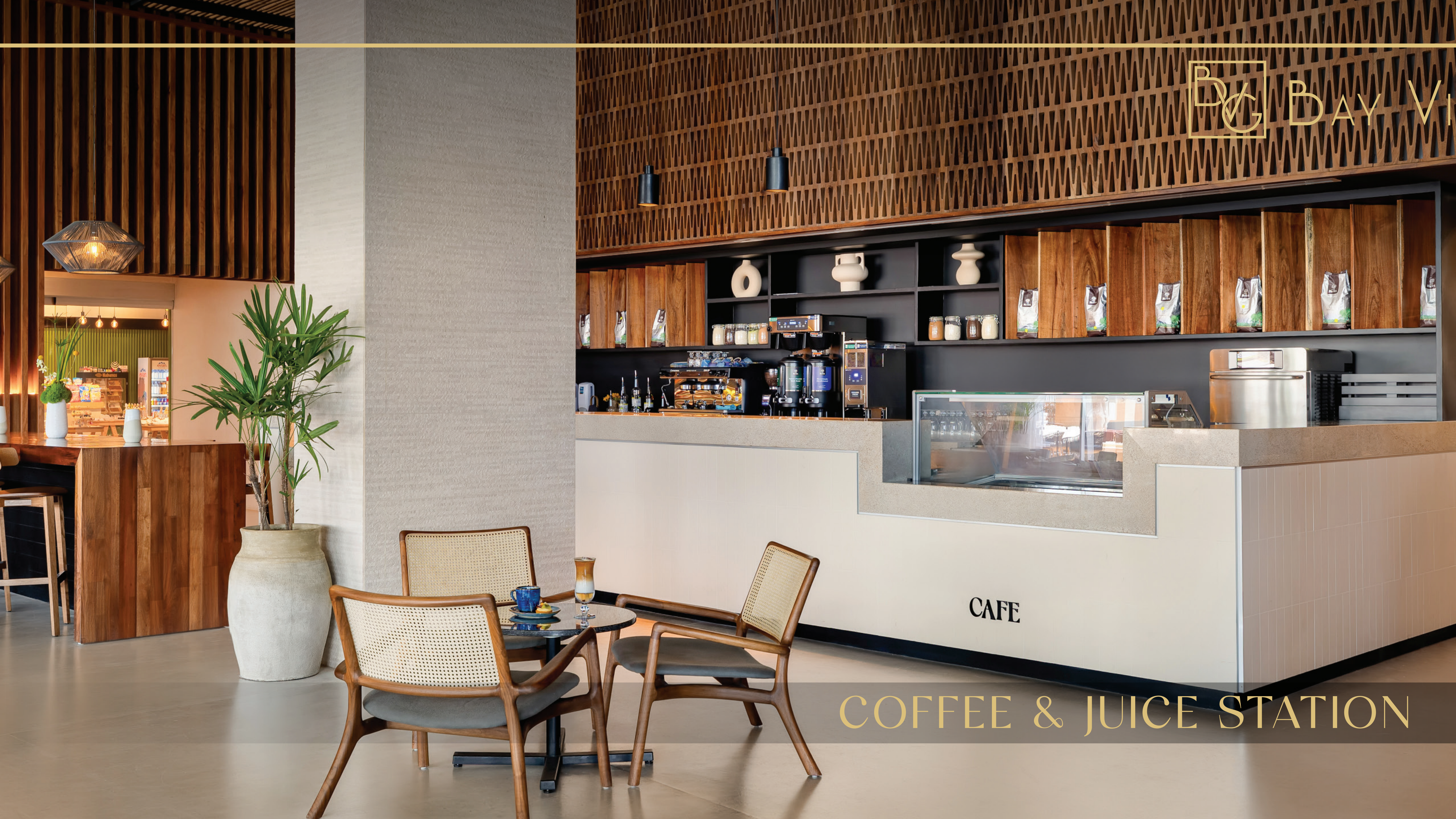
COFFEE & JUICE STATION