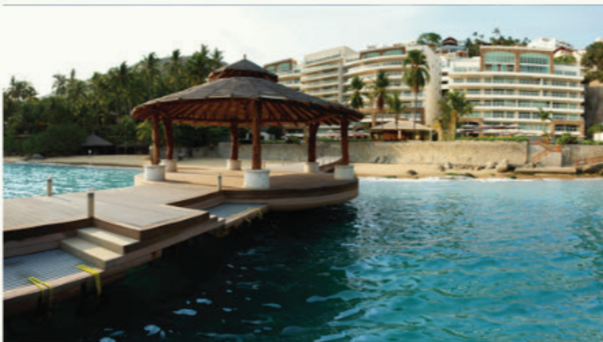
With a prime location on Acapulco Bay, it boasts a 100-meter private beach and 81 luxury condominiums sold.