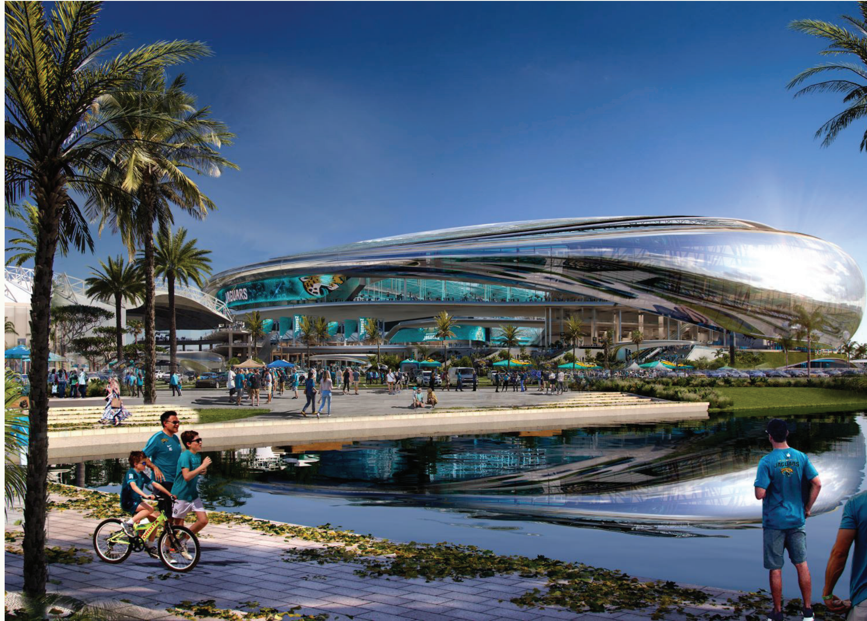
Jacksonville Jaguars Stadium of the Future

An acclaimed collaborative team of innovative artists, designers, engineers, and architects.