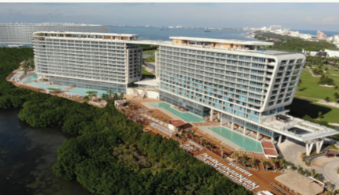
Event held on April 18, 2024 in Cancun, Quintana Roo.