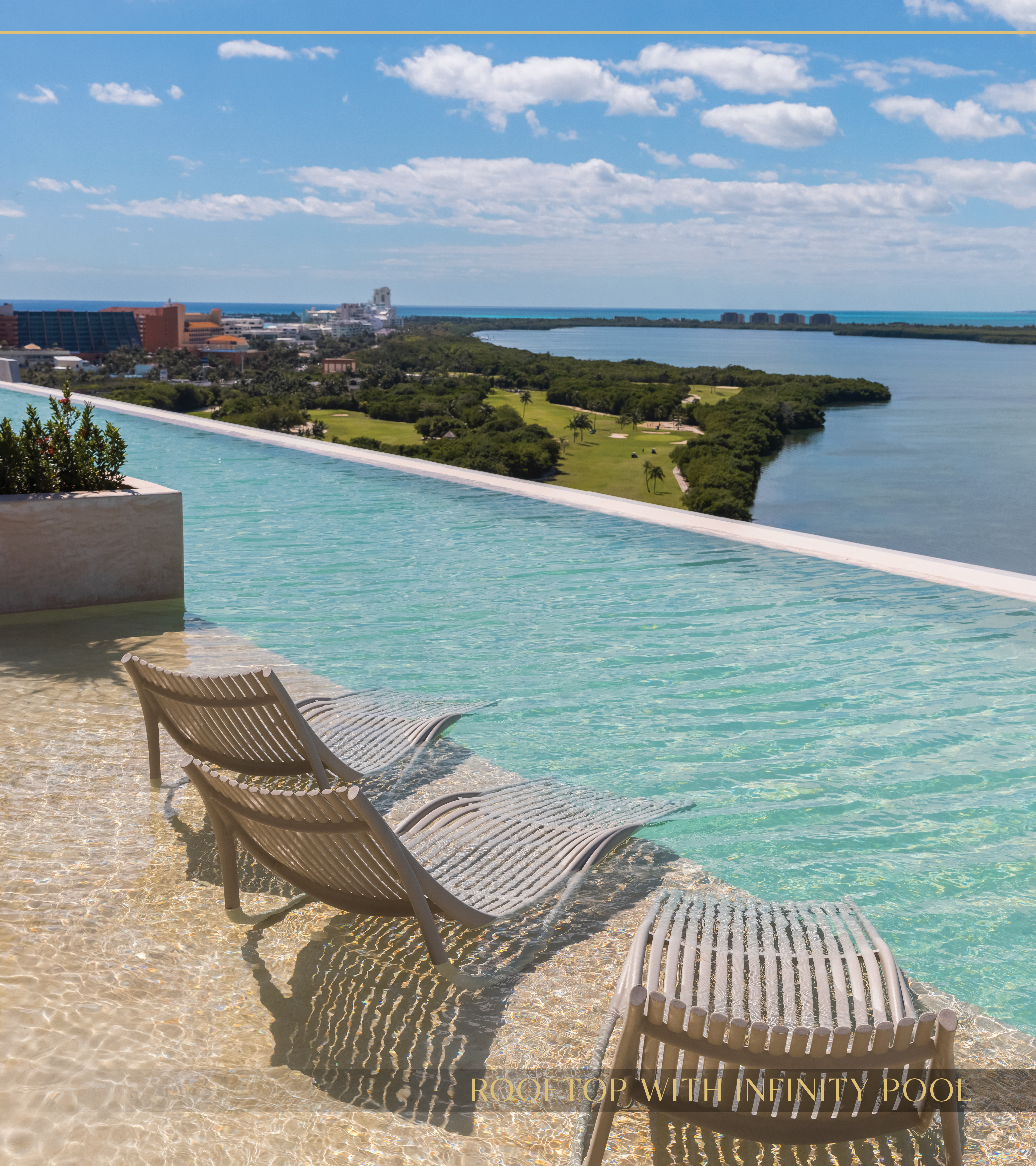
ROOFTOP WITH INFINITY POOL